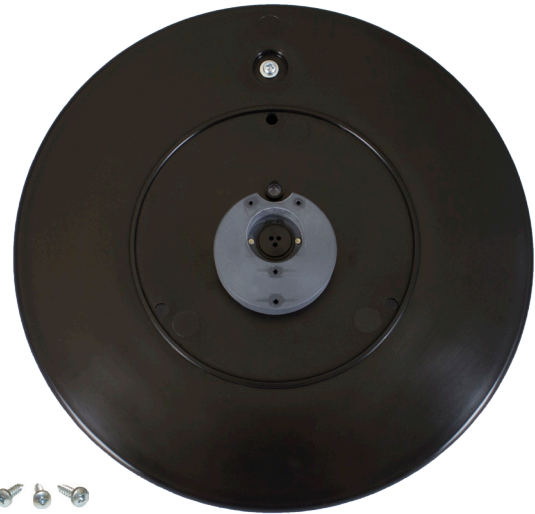
Back View of 101B Replacement Faceplate Assembly