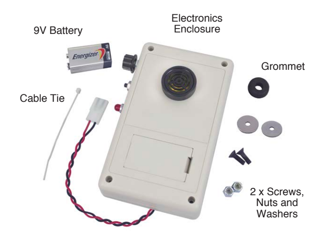
101 Power Reel Water Level Meter Electronics Assembly