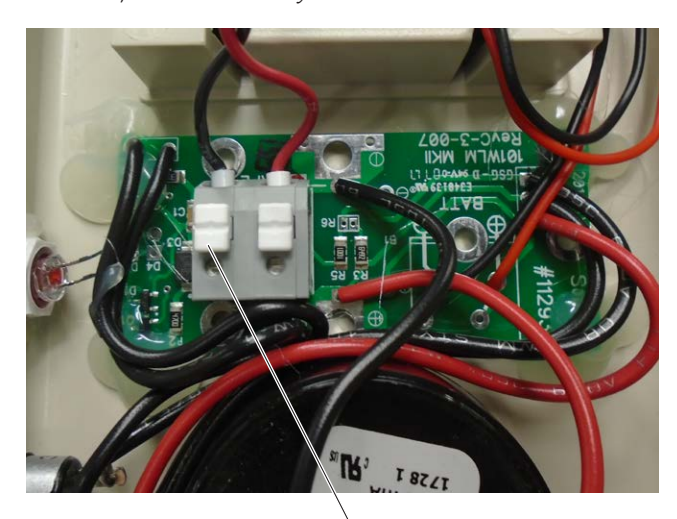
Push down on the white terminals to remove the red and back wires

11. From the new Water Level Meter electronics, press down on the white terminals to remove the red and black wires (with Molex connector) from the assembly.