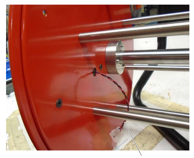
Secure wires with Molex connector to a spoke