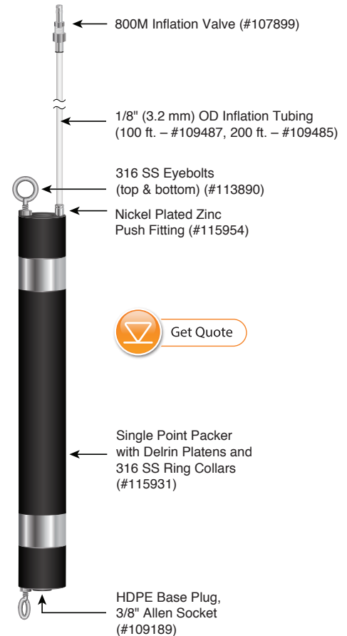
Standard Single Point Packer Setup with Inflation Line (Inflation Tubing and Valve Not Included with Packer)