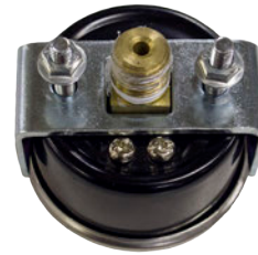
464 Panel Mount Gauge 1/8" NPTM (Spare) (#111823)