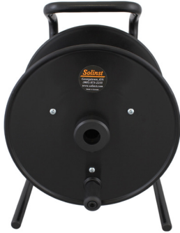
3001 SC1000 MKII Direct Read Cable Reel (#109752)