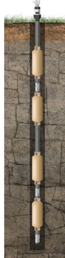
Up to 24 monitoring zones