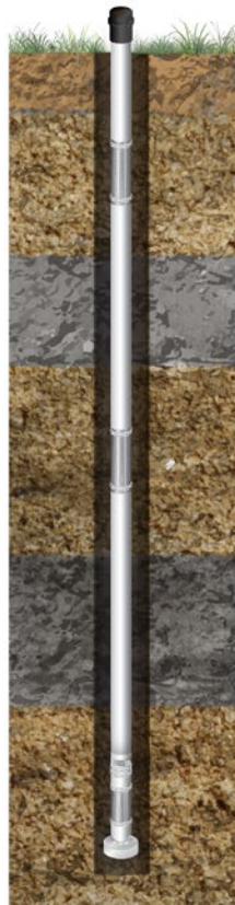
Up to 7 monitoring zones