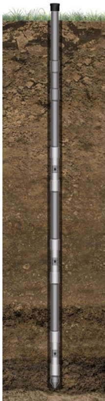
Up to 6 monitoring zones

Since the early 1980s, Solinst has been working with experts in the hydrogeology field to develop groundwater monitoring systems, which provide the high-resolution subsurface data that accurate subsurface investigations demand. Solinst manufactures three different types of multilevel systems, each suited to different environments and applications.