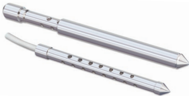
Model 615 Drive-Point and Shielded Drive-Point Piezometer