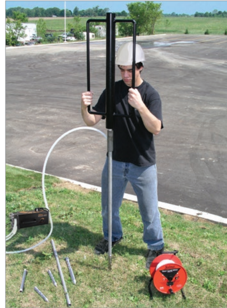
Installing Piezometers with a Manual Slide Hammer

Solinst Drive-Point Piezometers can be driven into the ground with any direct push or drilling technology, including the Manual Slide Hammer shown at right. To avoid clogging or smearing of the screen during installation, a shielded version is also available.