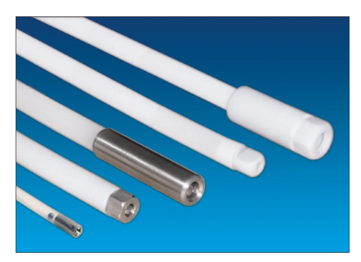
From left to right: Mini Inertial Pump, SS16, SS19, D16, and D25 Inertial Pumps