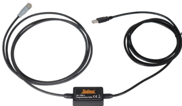
USB-A Programming Cable (only one required to program all your Water Level Temperature Sensors)