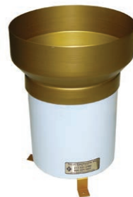
Tipping-Bucket with Normally-Open or Closed Style Reed Switch Output

The Rainlogger Edge comes with a Connector Cable, 2 m (6.5 ft.) in length. The Connector Cable has two wires, which are connected to the tipping-bucket cable. For most tipping-bucket models, the wires can be connected to either terminal. Refer to the manufacturer's operating instructions.