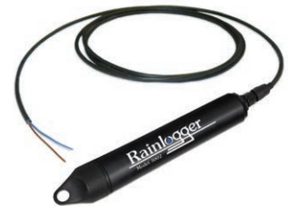
Rainlogger Edge with Connector Cable