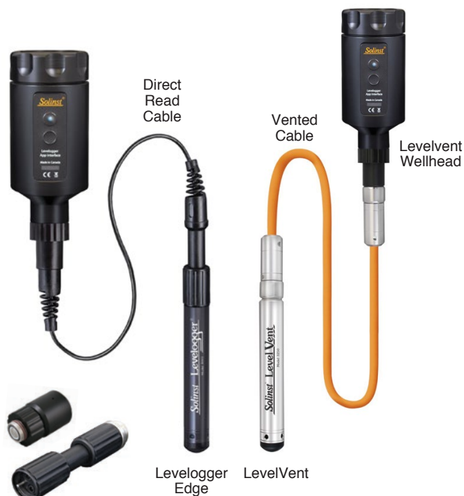
The Direct Read to Optical Adaptors allow you to directly connect your Levelogger to the Levelogger App Interface. Threaded and slip fit options.