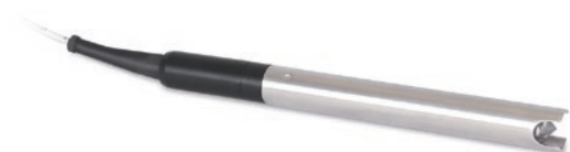
Model 122M P8 Probe

The 122M uses the P8 Probe, which is 16 mm (5/8") in diameter and stainless steel. It is pressure proof, up to 500 psi. The beam is emitted from within a Hydex cone-shaped tip. The tip is protected by an integral stainless steel shield, and is excellent for the vast majority of product monitoring situations. A cleaning brush is included with each Meter.