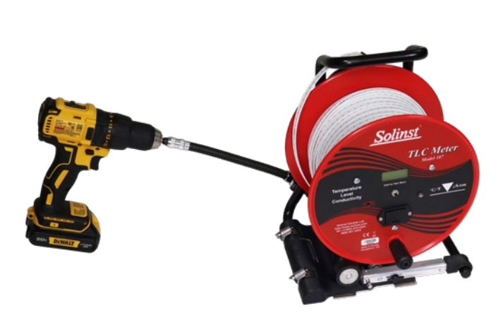
Solinst TLC Meter with Power Winder Installed to Make Temperature and Conductivity Profiling Applications Easier