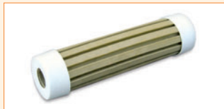
Pre-formed Bentonite Cartridge Ideal for Infilling