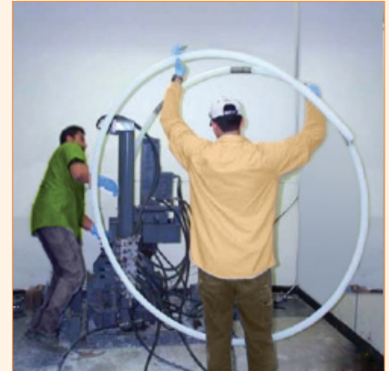
7-Channel CMT Installation to Monitor Groundwater and Soil Gas Beneath a Building