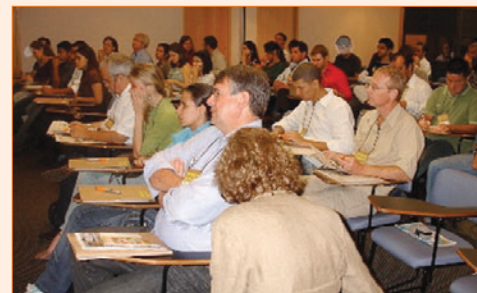
Attendees of the CMT Training in Brazil