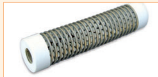
Spring Cartridges use Bentonite Pellets