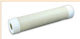
Sand Cartridge Filled in the Field

Clients source and choose sand for filling cartridges to suit their application and the information they are monitoring. Coarse sand will allow fine particles to reach the screened port, while fine sand will filter out smaller particles before reaching the port. The client also sources the bentonite pellets used in the spring cartridges. The bentonite pellets in the spring cartridges set more quickly than pre-formed bentonite cartridges - days versus weeks. As such, the spring cartridge is recommended as the primary seal. The choice between bentonite cartridges is also based on application and client preference.