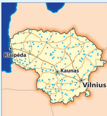
Approximate Location of Observation Wells in National Groundwater Monitoring Network

Groundwater is the sole source of drinking water in Lithuania; therefore, the importance of protecting this resource was recognized many years ago. To maintain their supply, a regular groundwater monitoring program was established in 1946. By 1962 the monitoring network had spread across most of the country, with more than 20 monitoring stations, including 190 observation wells.