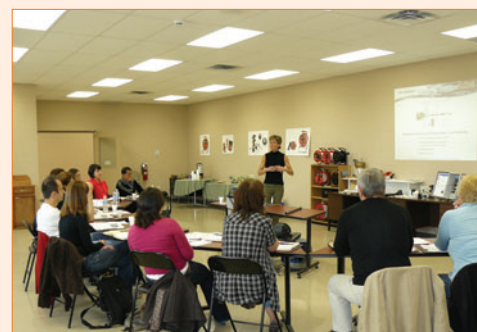
International Agent Training at Solinst

A group of International Agents came to Solinst for training in May and a follow-up group in July. Agents were welcomed from various parts of the world, including: Argentina, Bolivia, China, Denmark, England, Greece, Hungary, India, Iran, Lithuania, Romania and Spain.