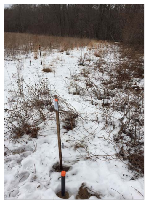
Groundwater Monitoring Wells Installed at Hibernaculum

The investigation will identify any differences, as well as characteristics shared, between the natural and installed hibernacula. This will provide insight into what features make up an effective hibernation site and assist in future