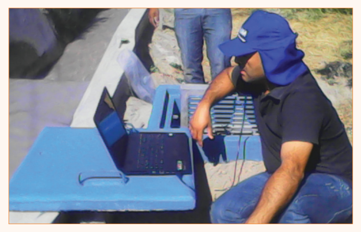
Water Level Data Downloaded in the Field Using a Laptop and Levelogger Software

To protect the Leveloggers (and associated Barologgers for barometric compensation of the water level data), concrete structures to house the instruments were built next to the flumes. A total of 148 monitoring stations have been installed in 6 different regions of Peru; 3 in Tumbes, 47 in Piura, 38 in Lambayaque, 27 in Huaral, 25 in Arequipa, and 8 in Tacna.