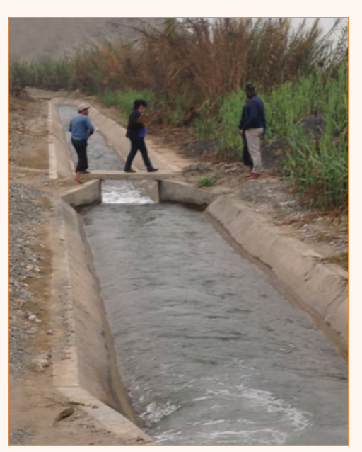
Flume Installed in an Irrigation Channel to Monitor Volume ....continued overleaf

The ANA has an objective of accurately calculating the average amount (volume) of water used by each of the Boards. This data will allow them to track and determine the ideal amount of water to allocate to each Board and the agricultural users in that region.