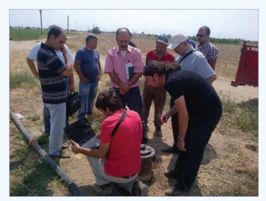
Preparing a Levelogger for Installation in the Akarçay Water Basin

FORAMEC, exclusive distributor of Solinst products in Turkey, supplied groundwater monitoring equipment to multiple water basins for use in 100 observation wells. The first project was the Akarçay Water Basin.