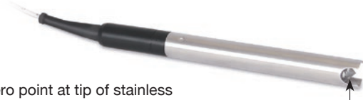
Zero point at tip of stainless steel conductivity pin

The 122M uses the P8 Probe, which is 16 mm (5/8") in diameter and stainless steel. It is pressure proof the full length of the submerged cable. The beam is emitted from within a Hydex cone-shaped tip. The tip is protected by an integral stainless steel shield, and is excellent for the vast majority of product monitoring situations. A cleaning brush is included with each Meter.